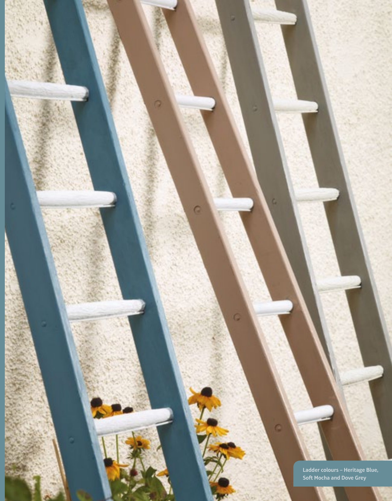
Ladder colours – Heritage Blue, Soft Mocha and Dove Grey

Varnish (water based polyurethane breathable products are preferable) – apply on top of interior coatings that will be subjected to high levels of wear and tear such as floorboards, table tops and kitchen work surfaces.